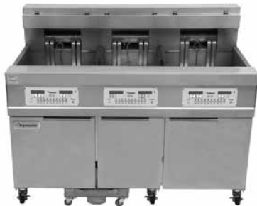
Model Shown: 11814E/RE17/11814E