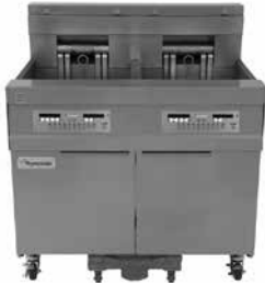
Model Shown: 21814E with optional filtration